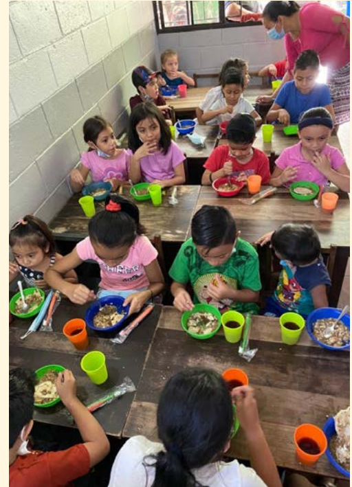
School children participating in feeding program in El Salvador

OAA's full financial statements can be accessed at www.oaausa.org/accountability