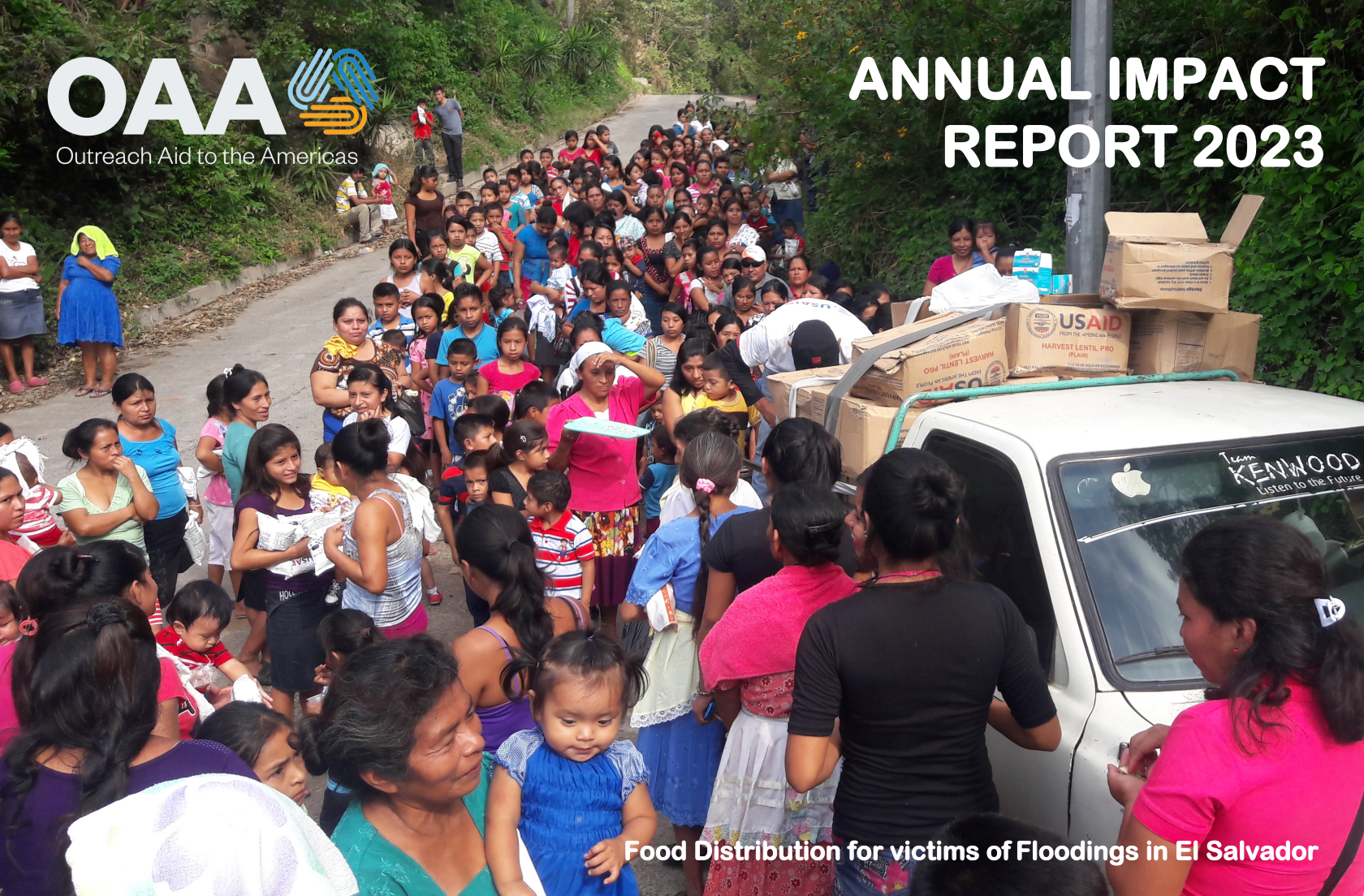
Food Distribution for victims of Floodings in El Salvador