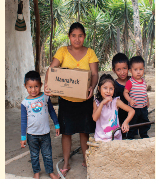
Grateful family receiving prepackaged food assistance in Apopa, El Salvador.

Helping our faith partners spread the Gospel and bring the materially poor and the poor in spirit to a closer union with our Lord Jesus Christ.